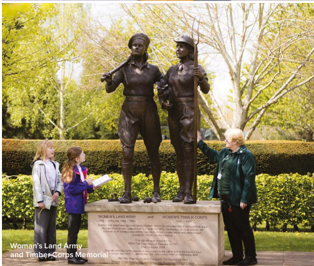
Woman's Land Army and Timber Corps Memorial