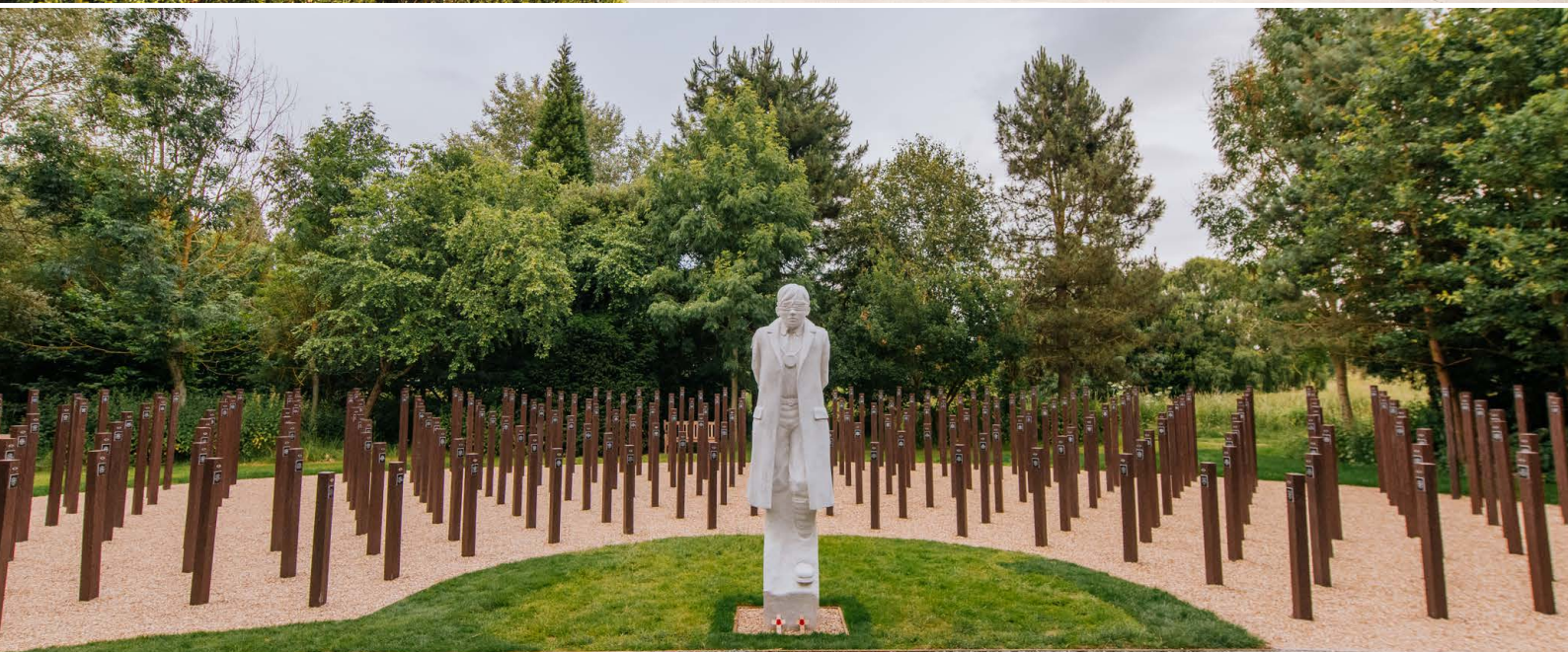
Shot at Dawn Memorial