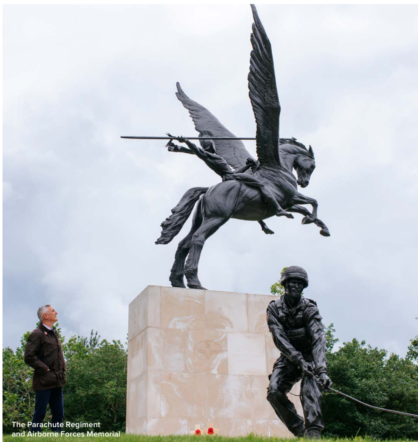
The Parachute Regiment and Airborne Forces Memorial