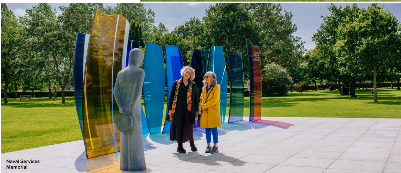
Naval Services Memorial