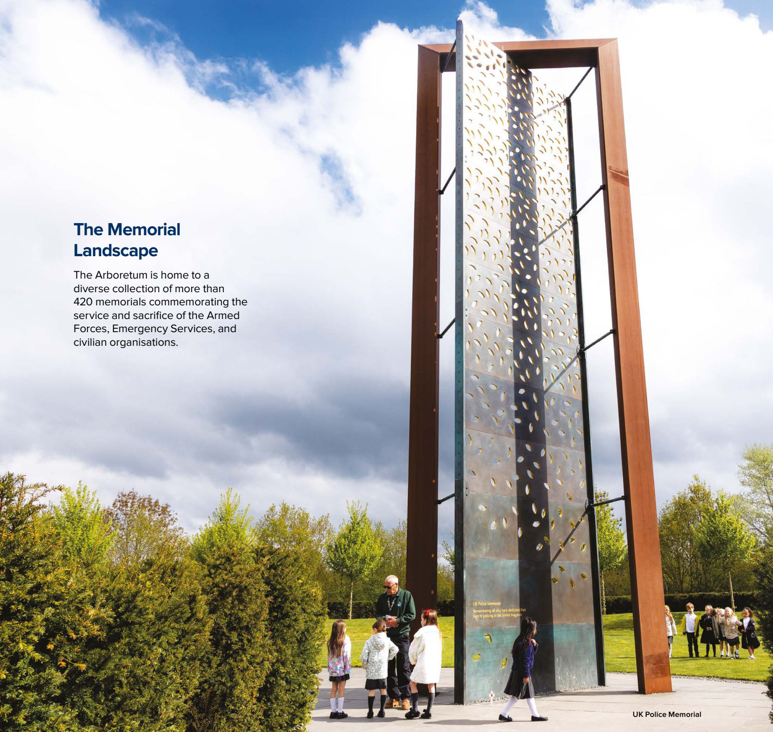
UK Police Memorial

The Arboretum is home to a diverse collection of more than 420 memorials commemorating the service and sacrifice of the Armed Forces, Emergency Services, and civilian organisations.