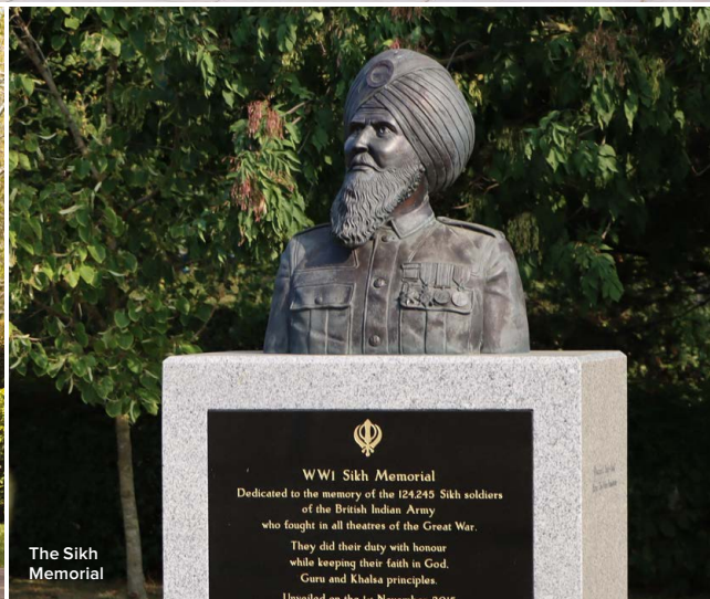
The Sikh Memorial